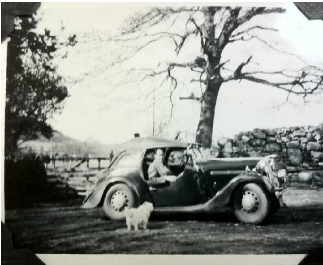
Figure 3: Car outside Llanerch-y-Felin