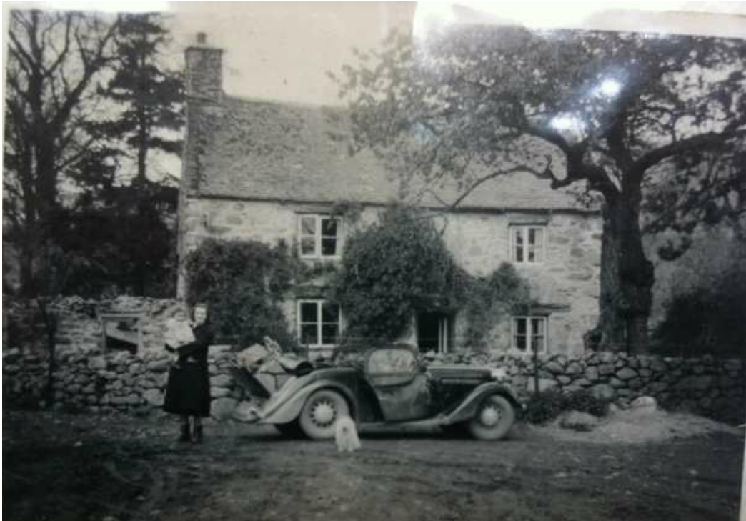
Figure 2: 1939