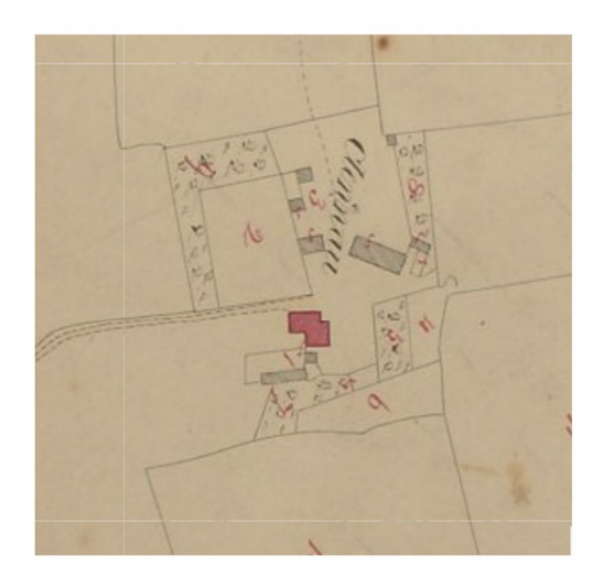
Extract from the Tithe Map (above) aligned to correspond to the plan (right) taken from RCAHMW, Caernarvonshire Inventory , II, 68 (visited 1955)

RCAHMW National Primary Record Number (NPRN)