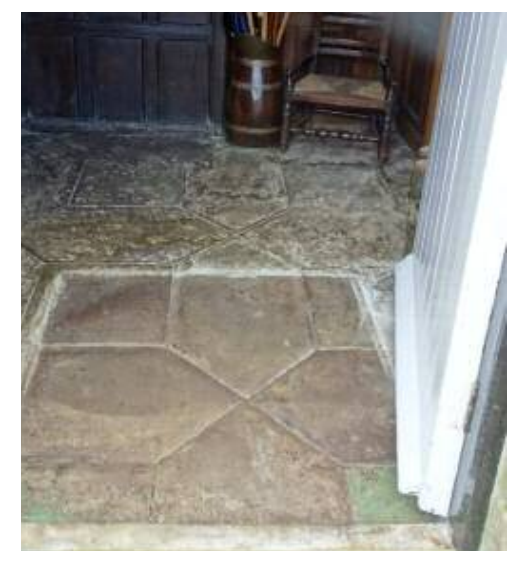
Stone floor of polygonal flagstones

retain your membership benefits. To make it easier you are encouraged to take out a Standing Order (see website for form). Otherwise please send your cheque to DOWH Membership Secretary, Caerfallen, Ruthin LL15 1SL (01824 704404) membership@discoveringoldwelshhouses.co.uk