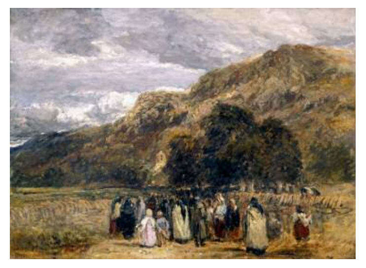
David Cox, A Welsh Funeral, Tate 4844

Victorian building on Denbighshire side of Betws-y-coed