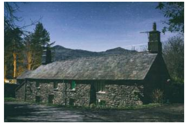
Plas Meini Llanffestiniog

PREIFATRWYDD – Mae'r tai a grybwyllir ar y wefan hon neu yn y Cylchlythyr hwn ac sydd â chysylltiad â DHDC yn breifat a dydyn nhw DDIM yn agored i'r cyhoedd ar unrhyw adeg PRIVACY – Houses mentioned on the website or in this Newsletter and /or linked with DOWH are private and are NOT open to the public at any time