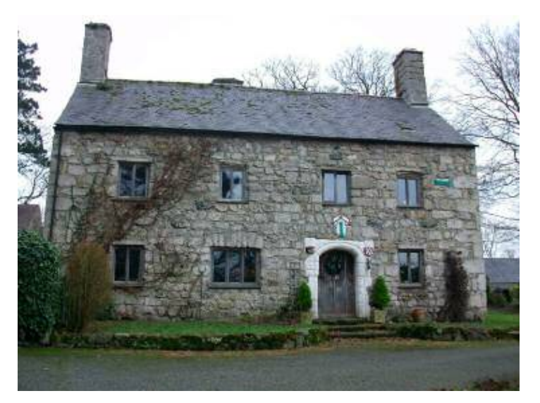
Plas Penmynydd Anglesey

Please do contact the Secretary if you are willing to offer a talk.