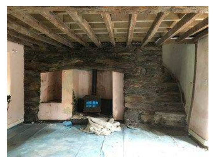
Plas Meini. One of two fireplaces in this Snowdonian semi.

As reported in the last newsletter a number of members have continued working on the parishes project and making occasional forays to see (usually unoccupied) houses. Small groups (never exceeding six!) sort out arrangements for themselves and it's sometime possible to combine a visit with a good country walk. Four of us ventured into the uplands above Llanegryn one crystal-clear autumn day to look at an unrecorded cruck house discovered by Gill Caves. The name Hafotty recalls its early function as a summer pasture for cattle or sheep. The house originally had two rooms, both open to the roof, the hall heated probably with a stack or smoke hood. A late-sixteenth century date is possible. At some point the hall was floored over and a stone wall inserted between the two rooms. At the time of the tithe assessment in 1844 the farm comprised around 78 acres of arable, pasture and meadow with 40 acres of sheepwalk and the 1841 census shows that it was farmed by Hugh Jones (aged 70) helped by three live-in servants. By 1887/8 there was a new farmhouse with agricultural buildings including a forge, which survives, once powered by a horse gin - the platform for the horse to make its