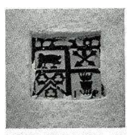
AMLWCH. (2) Madyn-Dysw, 1620.

The rear wing (marked as 1 on the map), incorporated into the north-south range of the house, retains some of the fabric of an earlier building, including a sub-medieval doorway with chamfered jambs and a 4-centred head. At the time the date stone was lost, the house and attached former stables and coach house were modernised to create three dwellings.