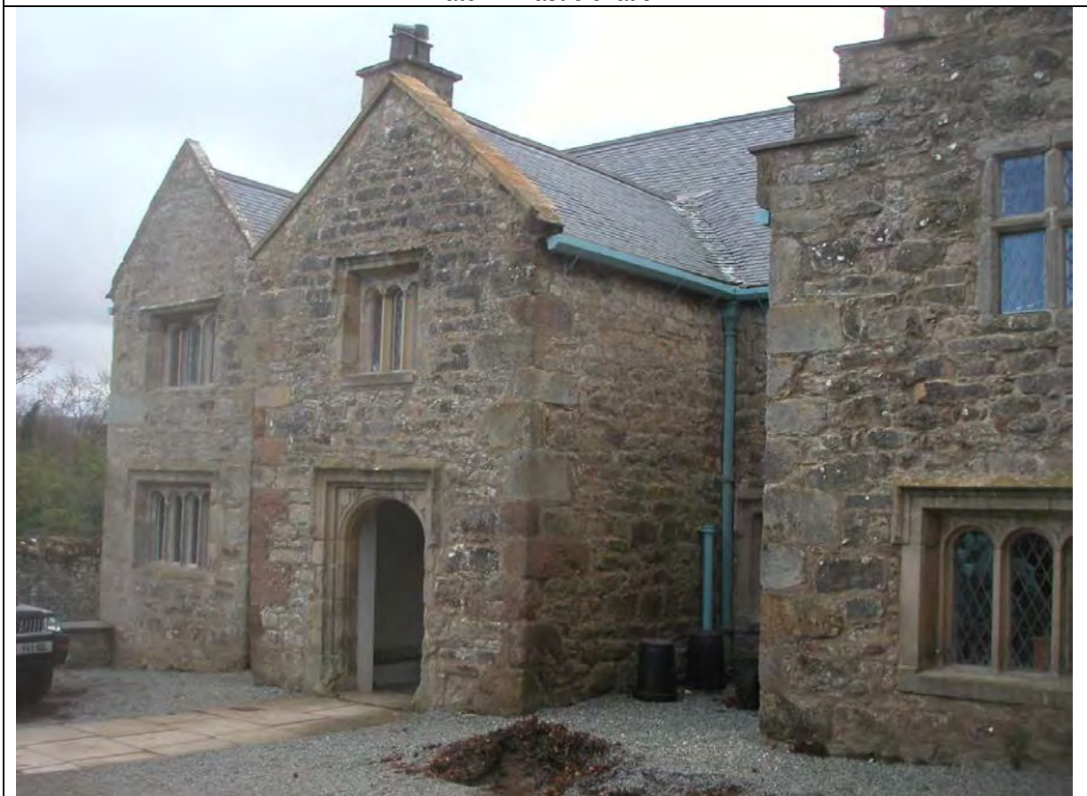
Plate 2 North (front) elevation