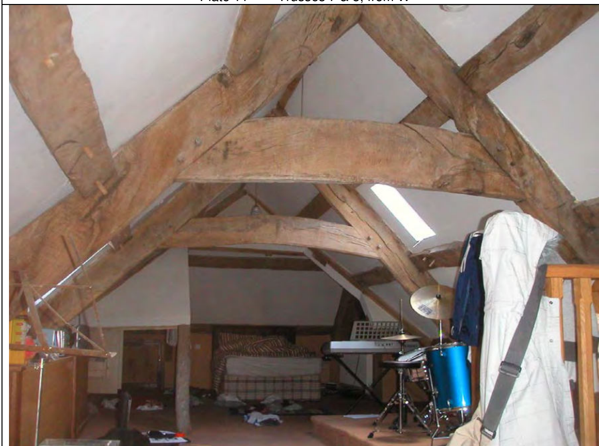
Plate 12 Trusses 10 & 11, from W