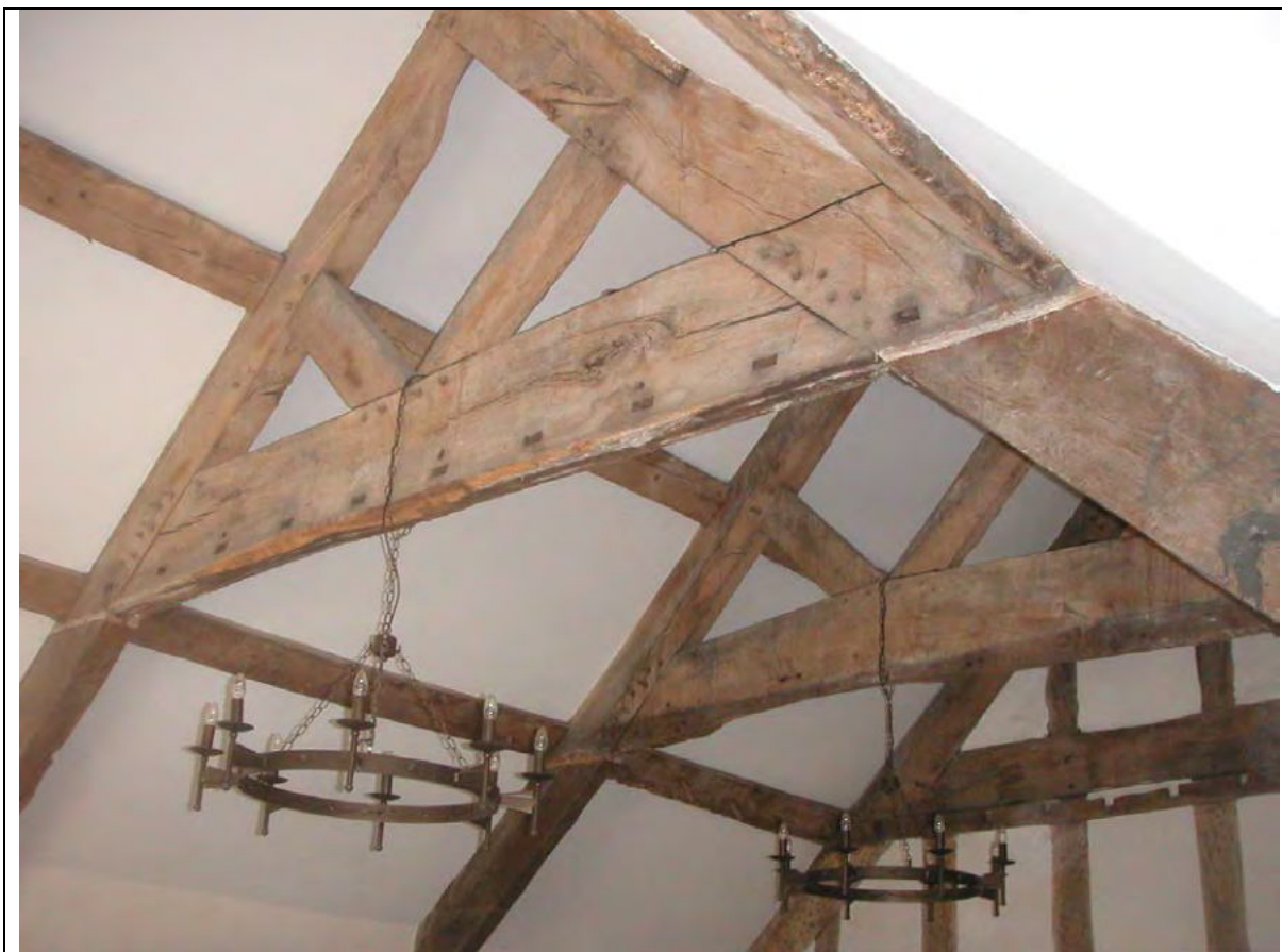
Plate 7 Truss 1 in foreground (from E)