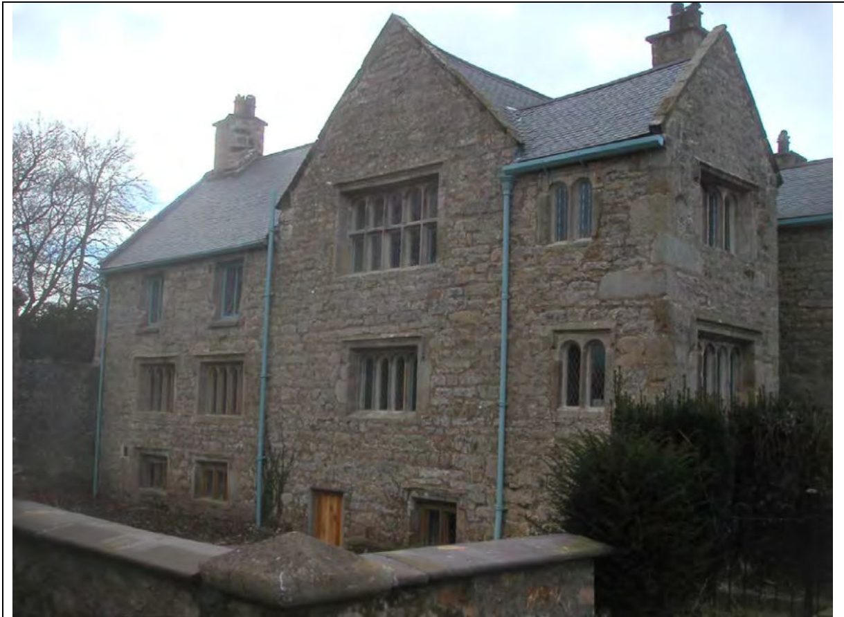
Plate 1 East elevation