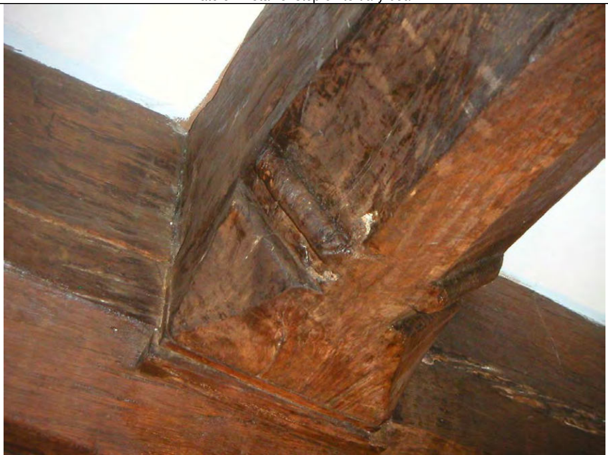
Plate 6 Ditto