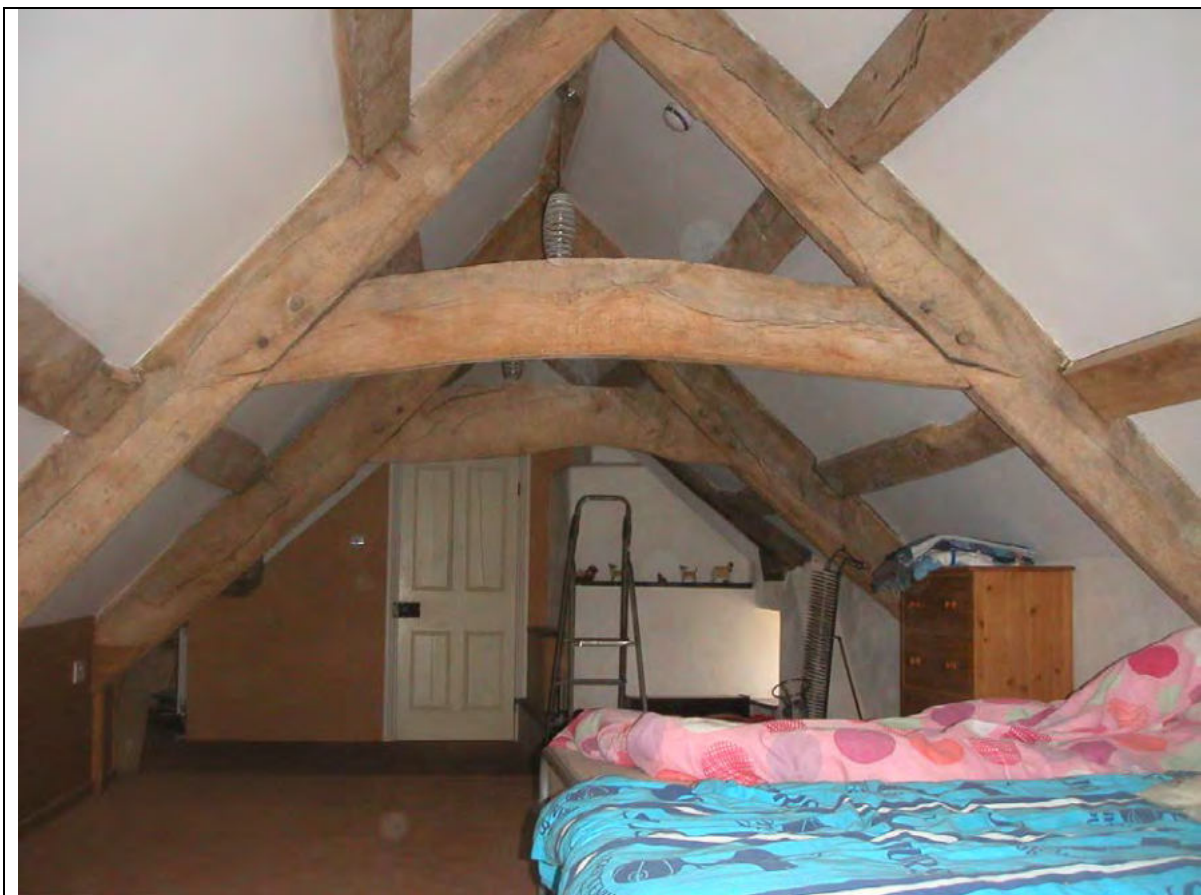
Plate 11 Trusses 7 & 8, from W