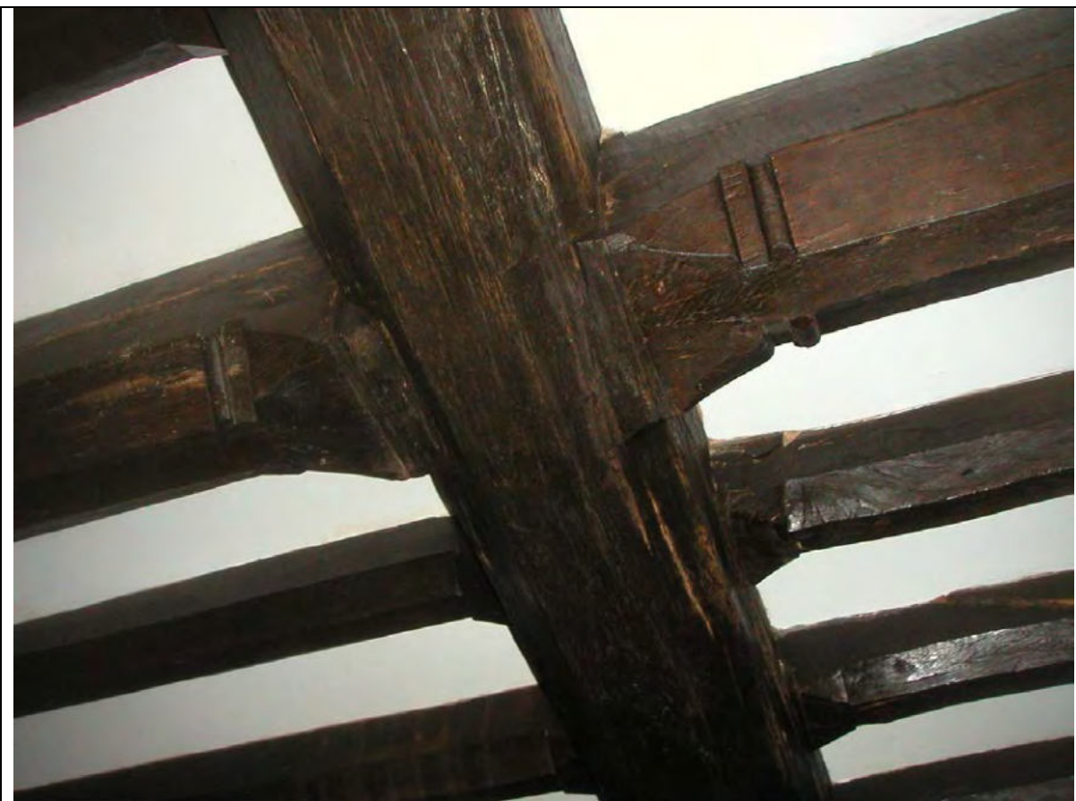
Plate 3 Ceiling to main hall (secondary and tertiary beams)