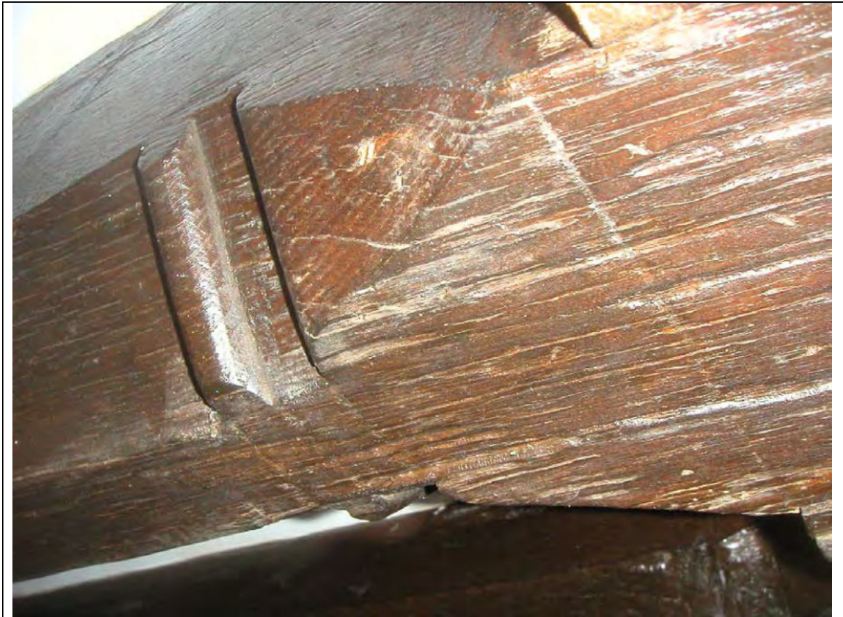
Plate 5 Detail of stop on tertiary beam