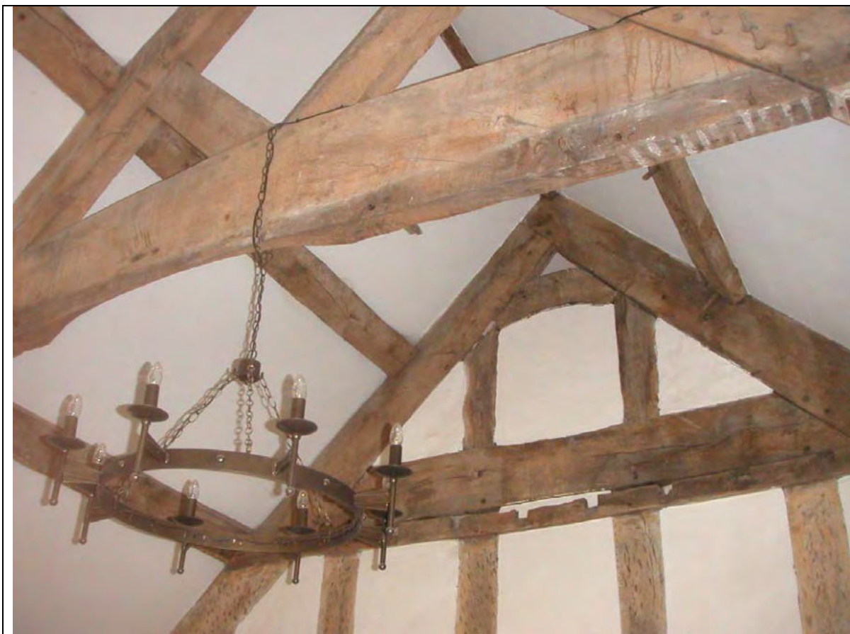
Plate 9 Trusses 2 and 3, from E