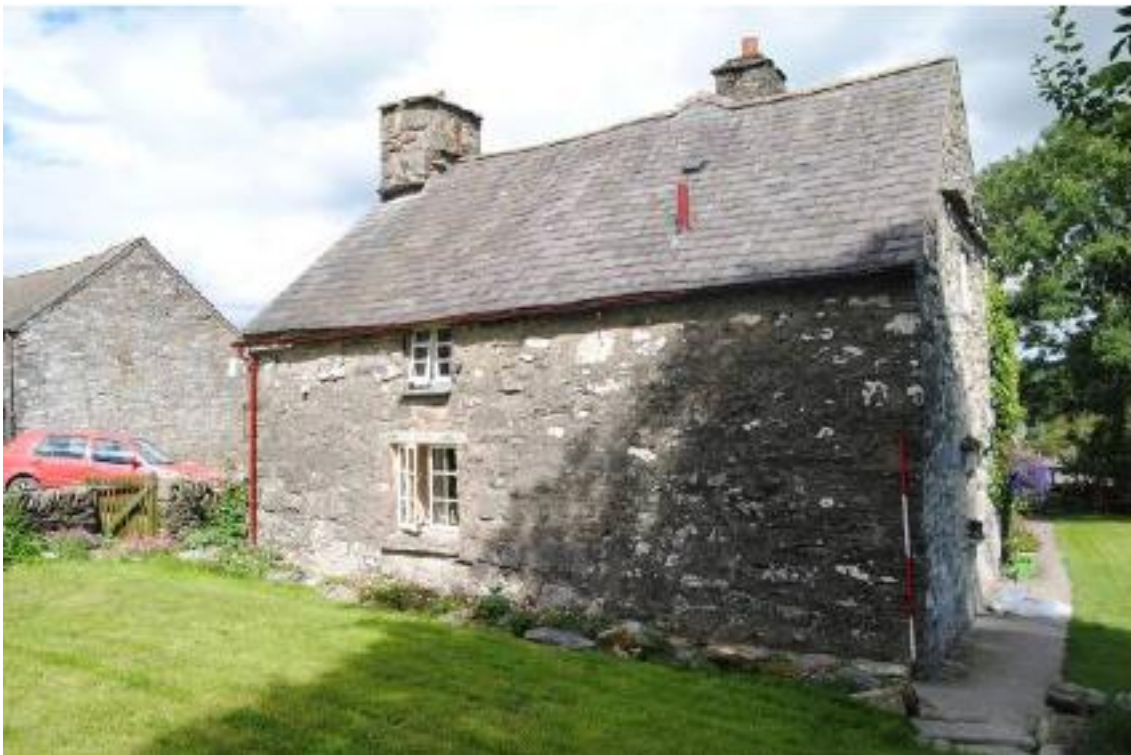
South Range Plate 3

South range – One Dendro sample dated from the northern principal rafter of the central truss dated with a tentative felling date range 1562-92 suggesting a construction date in the last decade of the 16 th century.