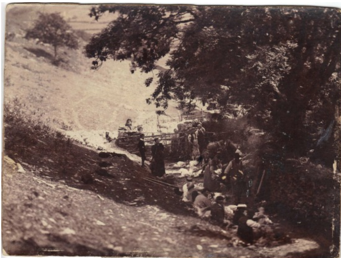
Photograph of Shearing at Bennar farm in the early 1900s Miss Ann Evans is in the photo