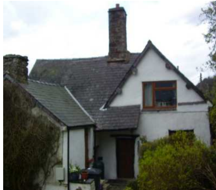
Fig 1 Sideview of Efenechtyd Farm.