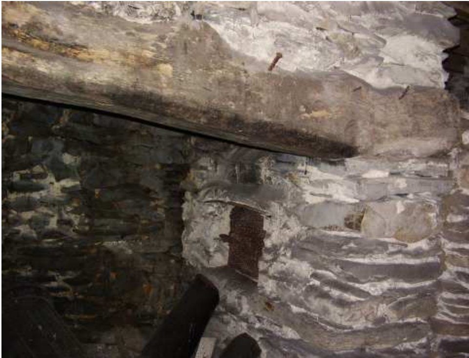
Fig 8a Bread oven