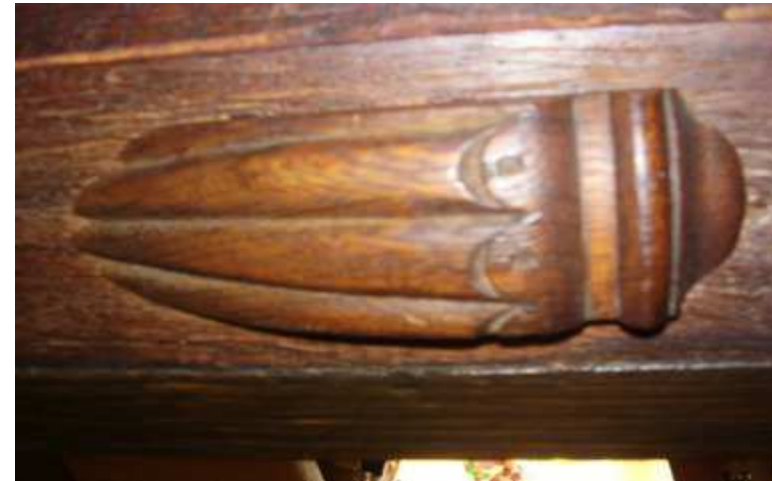
Fig 6. Carving on hand in oak panelled hallway.

Personal testimony from grand-daughter, still living in the area.