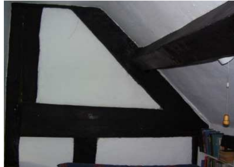
Fig 7. Part of cruck beam in upstairs bedroom.