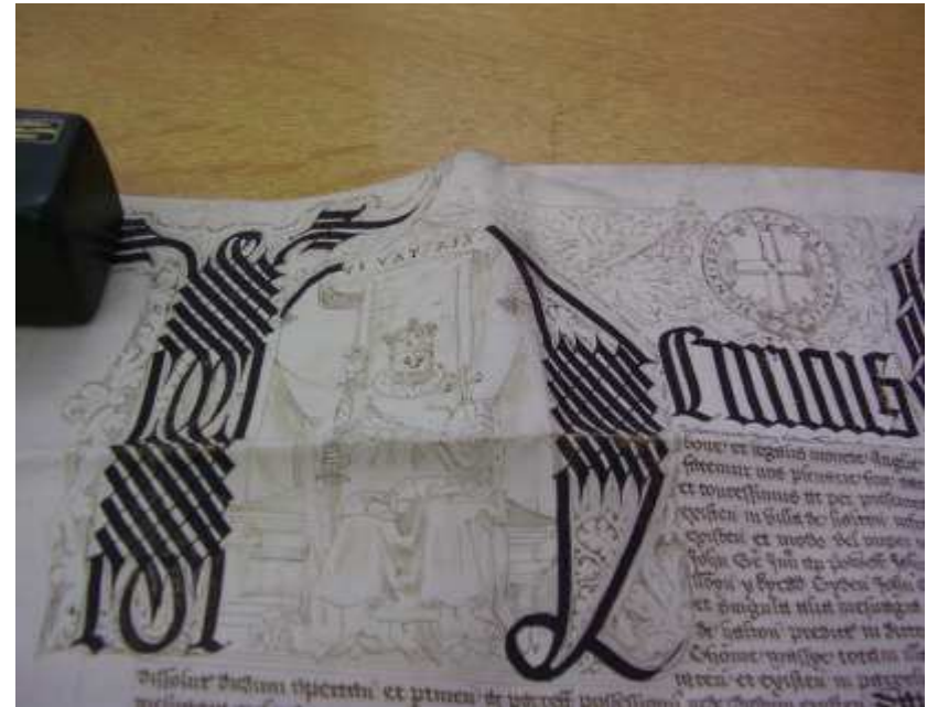
Fig 3b Close-up of portrait of Henry VIII on Thomas Massye's Letters Patent

Minister's account of lands owned for the Lordship of County of Denbighshire. Item 70 :Valle Crucis Abbey, Call no M8m The National Library of Wales.