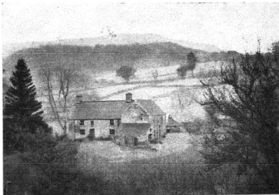
V. 4(a)—CAE-MARCH HOUSE AND BARN

Dendrochronology dates 4 timbers in the western, now restored range as 1541/1542 and it was originally a hall house. Unfortunately the timbers of the inserted floor and the fireplace lintel failed to date. The adjoining “farmhouse” has been reroofed and no samples were taken but the wall thickness suggests that it is medieval.