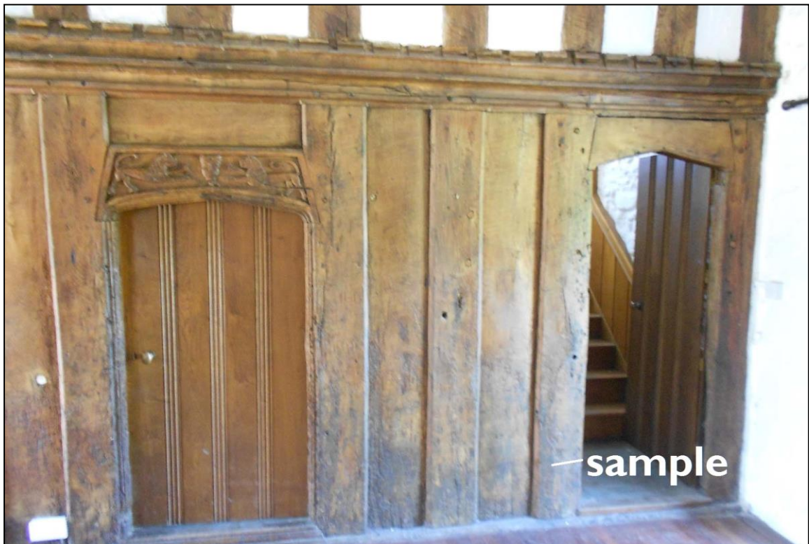
Figure 1: View of the screen, showing the approximate position of the sample taken for future radiocarbon analysis.

Although a previous brief assessment had suggested that this site was unlikely to be suitable for dendrochronological analysis because of the fast-grown nature of the timbers, it had not previously been possible to get close to the roof timbers. The erection of a scaffold tower made it possible to assess the roof timbers close-up, and this confirmed that the timbers of the magnificent hammerbeam roof did indeed contain too few rings to be viable for dendrochronological work. However, the advances in radiocarbon analysis in recent years have meant that this is often a useful technique for getting a statistically reliable narrow date range under certain circumstances. For this reason a single oak ( Quercus spp.) sample was extracted from a readily accessible timber in the screen (Figure 1), using a 15mm diameter borer attached to an electric drill. It was labelled and returned to the laboratory to be kept for future radiocarbon analysis should funds for this research be made available in the future.