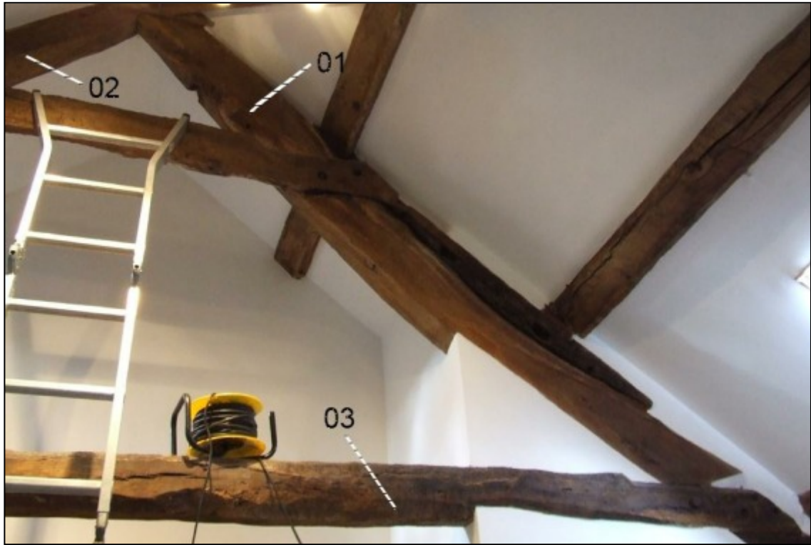
Figure 1: View of the east truss (looking west) showing the approximate positions of the samples 01 -03 from the two principal rafters and the lower collar.