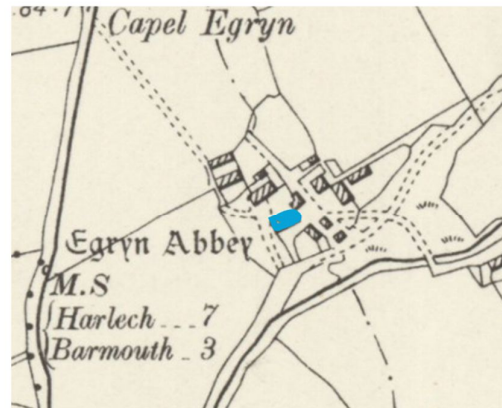
House marked in blue