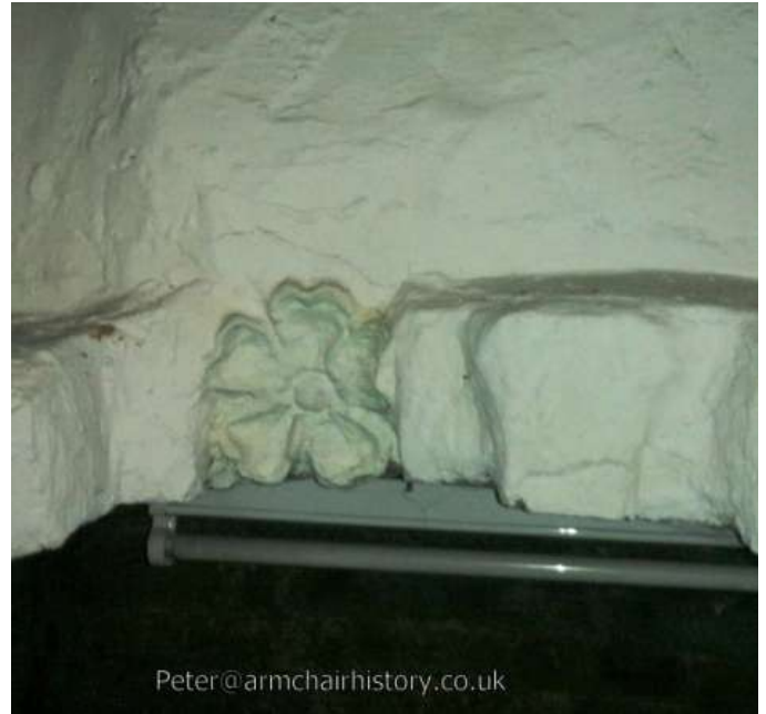
32 Stryd y Castell, 'Tudor Rose': rhosyn Lancastr? (nodwedd heb ei dyddio) / 32 Castle Street, 'Tudor Rose': rose of Lancaster? (undated feature)

Mae'r ddau eiddo hyn â choed wedi eu dyddio a'u dendro ddyddio i 1485/6 a 1483 yn eu tro. Mae hyn yn cyd-fynd yn dda â diwedd y Rhyfel ond hefyd yn awgrymu fod y tai hyn yn cael eu hadeiladu neu wedi eu hadeiladu cyn sefydlu teyrnasiad y Tuduriaid.