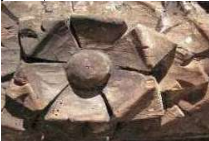
32 Stryd y Castell, Biwmares. 'Tudor Rose' (c1485/6) / 32 Castle Street, Beaumaris. 'Tudor Rose' (c1485/6)

Adroddiadau Dendro a Hanes Tai i sawl tŷ ym Miwmares, ac yn fwyaf arbennig i 32 Stryd y Castell (gyda'r enw 'Tudor Rose') a 34 Stryd y Castell, Red Boat. Mae'r ddau eiddo hyn â rhosynnau wedi eu cerfio a'u hymgorffori yn y trawstiau neu fel addurniadau i'r cyplau to. Yn 'Tudor Rose' gwelir hefyd gerflun o rosyn ar fwa'r lle tân.