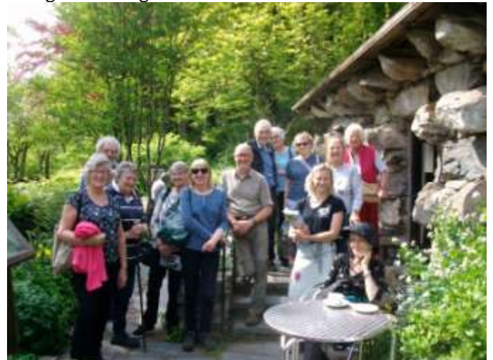
Ymweliad â Thŷ Hyll / Tŷ Hyll visit

Branch activities continue to flourish as small groups of members follow their interests in researching house histories, recording buildings and unusual marks in houses etc. across north Wales. Merioneth members have been preparing for the May exhibition in Aberdyfi of their research in Cwm Maethlon; NE Wales members are following up the house histories of houses architecturally recorded or "dendro-dated" in last financial year's project. The Caernarfonshire / Tesco local history project goes from strength to strength.