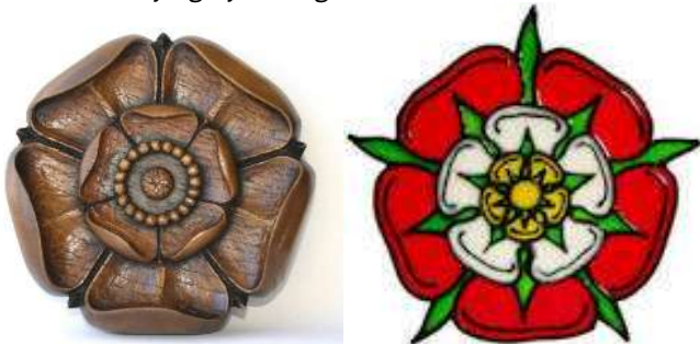
Rhosynnau Tuduraidd / Tudor roses

Roedd Tuduriaid Penmynydd ger Biwmares, Ynys Môn yn gefnogwyr i Dŷ Lancaster, ac yn dilyn llwyddiant Harri Tudur ym mrwydr Bosworth yn 1485 daeth Rhyfel y Rhosynnau i ben. Aeth yr olyniaeth i ddwylo Harri ac fe simentiodd ei hawl er braidd yn denau, i'r orsedd drwy briodi Elisabeth o Efrog, merch y Brenin Edward IV, Iorciad. Bu eu priodas yn 1486 yn fodd i uno'r ddau dŷ ymladdgar unwaith ac am byth. Tua'r adeg hwn y gwnaeth Harri (bellach yn Frenin Harri VII) gyflwyno'r Rhosyn Tuduraidd, a gyfunodd rosyn coch Lancaster a rhosyn gwyn Efrog.