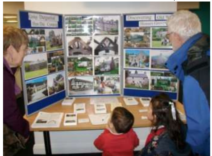
Arddangosfa Prestatyn / Prestatyn Exhibition