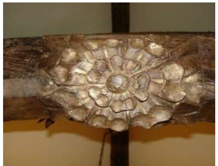
34 Stryd y Castell, 'Red Boat' (c.1483) / 34 Castle Street, 'Red Boat' (c.1483)

Felly a oedd y cerfiadau yn bod yn barod neu wedi eu hychwanegu yn hwyrach? Maent yn ymddangos yn rhai sengl, yn steil rhosod Tŷ Lancastr – nid rhosynnau uniad dwbl y Tuduriaid fel a welir.