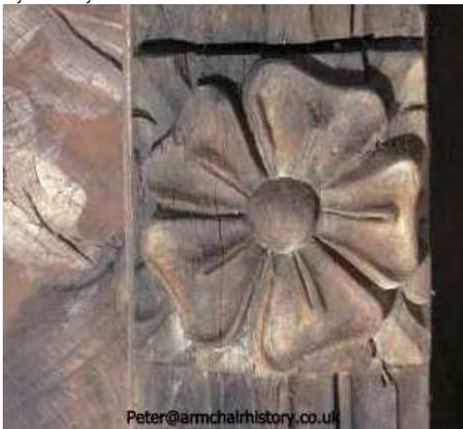
32 Stryd y Castell, Biwmares. 'Tudor Rose' (c1485/6) / 32 Castle Street, Beaumaris. 'Tudor Rose' (c1485/6)

So were the carvings already extant or later additions? They would appear to be single, in the style of House of Lancaster roses – not the double Tudor roses of unification, as can be seen.