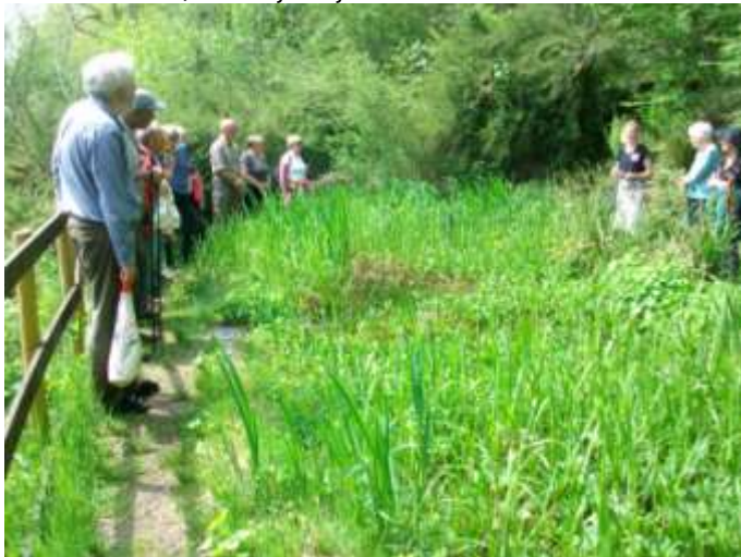
Coedydd Tŷ Hyll ym Mai / Tŷ Hyll woods in May

Gweithgareddau Canghennau yn dal i ffynnu wrth i grwpiau bychain o aelodau ddilyn eu diddordebau yn ymchwilio i hanes tai, cofnodi adeiladau a marciau anarferol mewn tai a.y.b. ar draws gogledd Cymru. Mae aelodau Merionnydd wedi bod yn paratoi ar gyfer arddangosfa Fai yn Aberdyfi drwy ymchwilio yng Nghwm Maethlon; mae aelodau GDdn Cymru wedi bod yn dilyn hanesion tai y tai hynny a gofnodwyd yn bensaernïol neu a ddendro-ddyddiwyd ym mlwyddyn gyllidol olaf y prosiect. Mae prosiect hanes lleol Sir Gaernarfon / Tesco yn mynd o nerth i nerth.