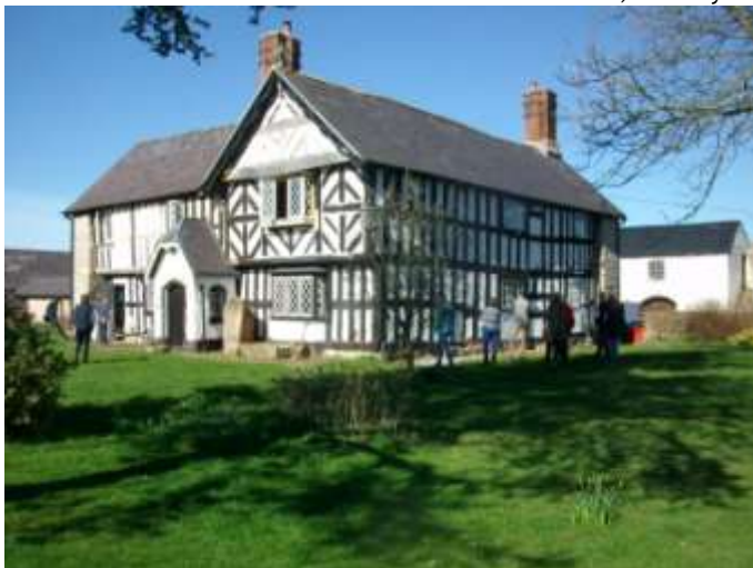
Cynrychiolwyr VAG yn ymweld â Chaerfallen / VAG delegates visit Caerfallen