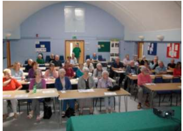
Sgwrs am Frychdwn / Broughton Talk