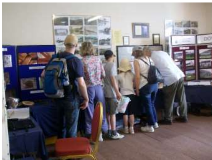
Arddangosfa fis Mai yn Nhywyn May exhibition in Tywyn

Cronfa Eryri Parc Cenedlaethol Eryri Mae'r gronfa hon yn dal i gefnogi gwaith ym Meirionnydd a samplwyd dau dŷ yn Awst. Roedd arddangosfa fis Mai yn Nhywyn, ac a drefnwyd gan Gangen Meirionnydd, yn llwyddiant mawr, diolch i dîm o wirfoddolwyr parod. Yn Awst roeddem yn rhannu stonid ag Ymddiriedolaeth Archeolegol Gwynedd yn Sioe Sirol Meirionnydd a hefyd yn Sioe Amaethyddol Ynys Môn. Mae grant Cronfa Gymunedol 'Bagiau o Gymorth' Tesco yn dal i gefnogi digwyddiadau misol hyd at ddechrau Hydref.