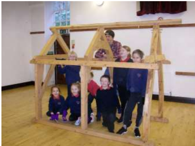
Plant yn adeiladu tŷ nenfforch Children construct a cruck house

COFIWCH fod yr holl dai y sonnir amdanynt yn y Cylchlythyr hwn ac/neu sy'n gysylltiedig â GDHDC yn eiddo preifat ac felly NID ydynt ar agor i'r cyhoedd. Gall aelodau gymryd rhan mewn unrhyw ddigwyddiad mewn unrhyw gangen, yn ogystal ag yn eu cangen eu hunain. Holwch gysylltydd y gangen dan sylw.