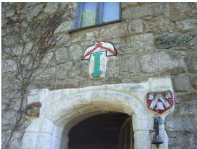
Mynedfa, Plas Penmynydd, Ynys Môn

ei defnyddio'n amlach, a dweud amdani wrth ein ffrindiau. I'r rhai ohonoch sy'n teimlo ei bod yn rhy anodd, mae gen i gyngor syml.....mentr wch! Fe'i cewch ei bod yn sythweledol ac yn hawdd ei defnyddio.