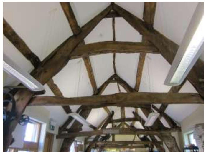
Count the crucks Cyfrifwch y nenffyrch

NE Wales Project Year 3: Further houses have been visited since Easter, and the Oxford Dendrochronology Lab experts assessed and sampled selected houses in August. Cruck and early storeyed houses continue to be our main focus.