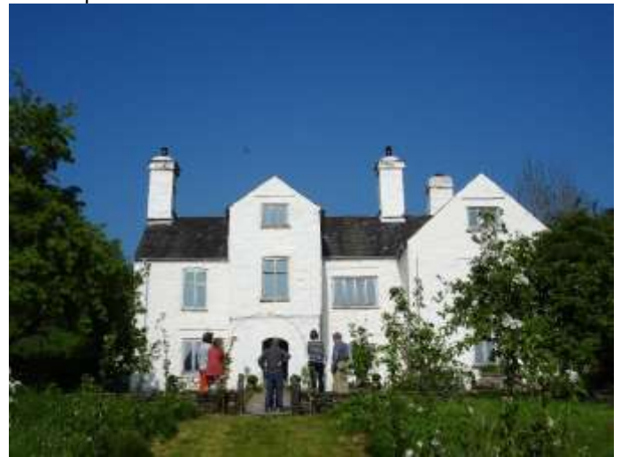
Plas Tirion, Llanrwst

Tues 12 Feb 2pm St Asaph Cathedral guided visit. Meet in the car park.