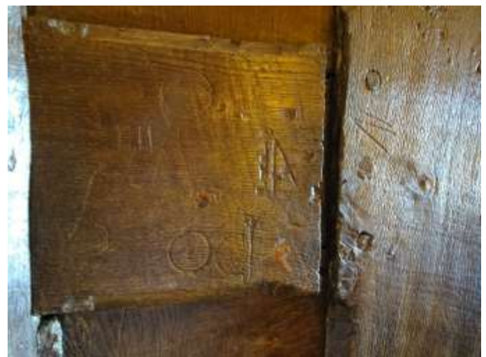
Mystery marks on screen near Mold Marciau dirgelwch ar sgrîn ger yr Wyddgrug