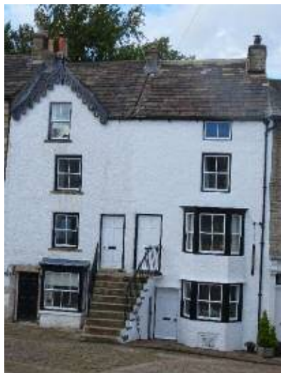
Extramural stairs to original front doors in Alston Grisiau allanol ar gyfer drysau ffrynt gwreiddiol yn Alston