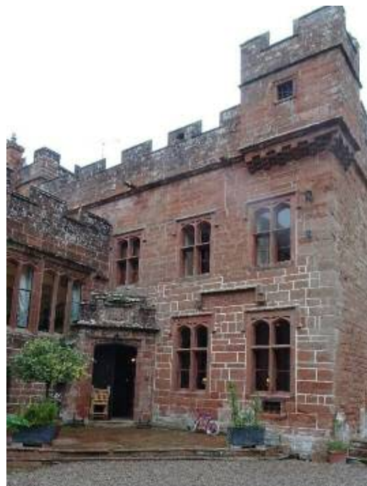
Newbiggin Hall, Cumbria Neuadd Newbiggin, Cumbria

On September 10 th twenty-six members and friends of DOWHG joined our Study Tour.