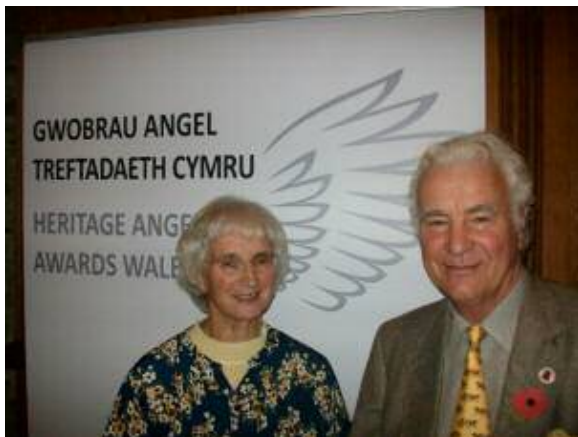
Ein Hysgrifenyddes a'n Cadeirydd yn y seremoni wobrwyo Our secretary and chairman at the awards ceremony