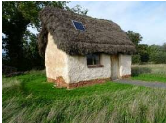
New clay dabbin house Tŷ newydd wedi ei ddabio â chlai (dabbin)