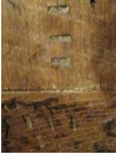
Carpenter's assembly marks Marciau adeiladu saer

Bydd marciau gwrthfelltithiol/apotropäig , (sy'n debyg o gadw cythreuliaid draw) a marciau eraill megis marciau cydosod a marciau canhwyllau cwyr o hyn ymlaen yn cael eu cofnodi yn fanylach. Gadewch wybod i ni am unrhyw dý sydd â rhain.