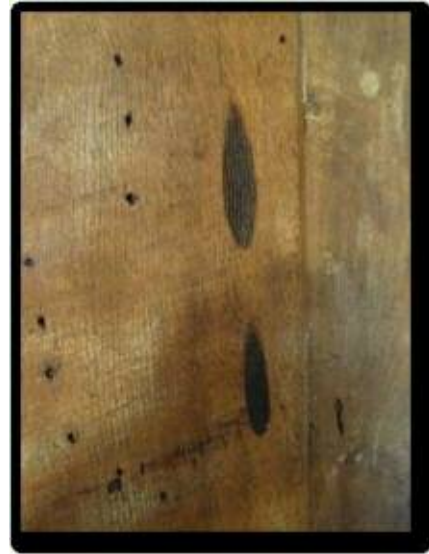
Taper/Burn marks Marciau llosgi canhwyllau

Apotropaic marks (thought to ward off evil) and other marks such as assembly marks and taper burns are now to be recorded in more detail. Please let us know about any houses with these.