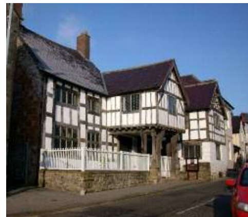
Nant Clwyd y Dre

Thurs 14 March 9.30am Visit to Llanerch y Felin, Rowen. Numbers limited, please book.