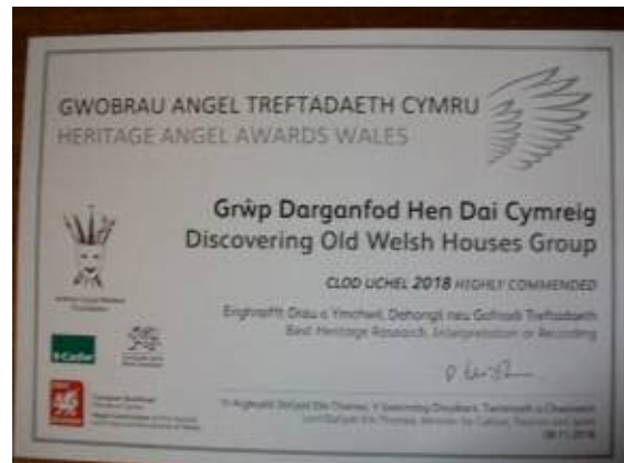
Award Certificate Tystysgrif y Wobr