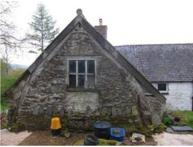
Hendre, tŷ ffrâm nenfforch yn Llandrillo (Sir Ddinbych, Meirionnydd gynt), a godwyd yn wreiddiol fel ffermddy iwmon yn 1502/3 (dyddiad dendrolegol) gydag ychwanegiadau diweddarach. (Ymwelodd cangen Meirionnydd â'r tŷ yn yr hydref)

Hendre, a cruck-framed house in Llandrillo (Denbighshire, formerly Merioneth), originally built as a yeoman's farmhouse in 1502/3 (dendro date) with later additions. (Visited in the autumn by Merioneth branch)