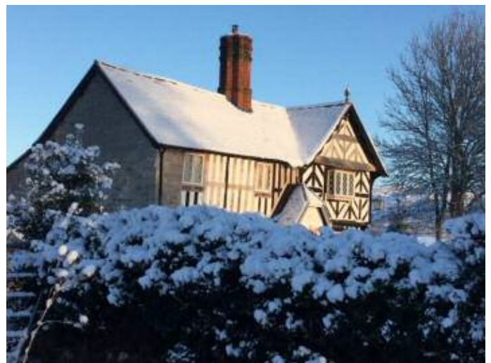
Caerfallen (dated 1559/60) near Ruthin, last winter Caerfallen (dyddiedig 1559/60) ger Rhuthun, y gaeaf diwethaf