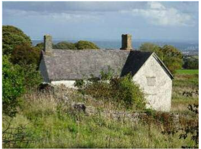
A historic farmhouse with a Jacobean staircase and a 1652 datestone in Brynford, Flintshire is on the at-risk register and is continuing to deteriorate. (Grade Two listed in 1962)