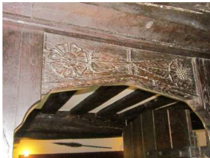
Decoration on a timber-framed building, Katryn of Berain's house, Denbs Addurn ar adeilad ffrâm goed, tŷ Catrin o Ferain, Sir Ddinbych