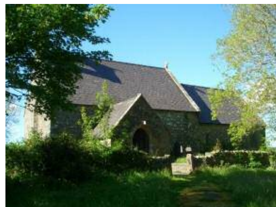
St Gredifael's Church, Penmynydd, Anglesey, location of the alabaster tomb of the ancestor of the royal house of Tudor