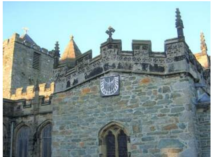
St Cybi's Church, Holyhead Eglwys Cybi Sant, Caergybi

Feb 20th (Thurs) 2-4pm Another session in the Archives at Llangefni for the Parishes Project. Of the 40 modern parishes on Anglesey, almost half have been looked into for listed buildings. This is a chance for those who have already done some work on the project to come together and discuss their findings and a chance for newcomers to be shown the ropes. Light refreshments, cost £2. Numbers limited to 20.