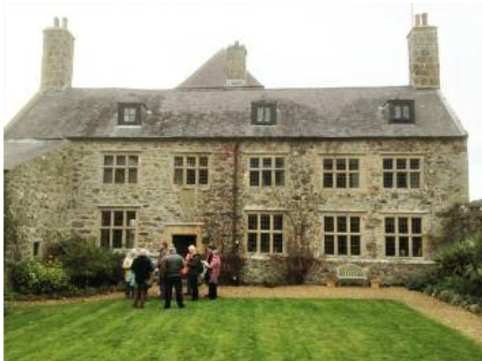
Pentre Berw, plasty o'r 17g, Gaerwen, Ynys Môn Pentre Berw, 17C Manor house, Gaerwen, Anglesey

22 Ionawr (Mercher) 2-4yp Ymweliad ag Eglwys Cybi Sant, Caergybi. Sefydlwyd yr eglwys yn wreiddiol yn 540 OC ac fe'i codwyd o fewn muriau'r gaer Rhufeinig. Mae'r eglwys bresennol yn dyddio o'r 13 eg i'r 16 eg ganrif. Arweinir taith dywys gan un o'r plwyfolion ac efallai y bydd lluniaeth ysgafn ar gael. Cost £2, sef cyfraniad i'r eglwys.