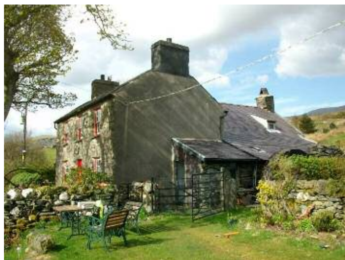
Ffridd Isaf, tŷ Eryri (dyddiedig 1699/1600), Rhyd-ddu Ffridd Isaf, Snowdonia house (dated 1699/1600), Rhyd-ddu