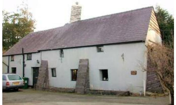
Ty'n Twr, tŷ nen-fforch, Bethesda Ty'n Twr, cruck-framed house, Bethesda