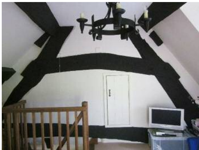
Pâr o nenffyrch, un o bedwar pâr sydd wedi goroesi yn y tŷ hwn o'r 16eg ganrif a fu ar un pryd yn dŷ neuadd yn Sir Ddinbych A pair of crucks, one of four surviving pairs in this 16C former hall house in Denbighshire